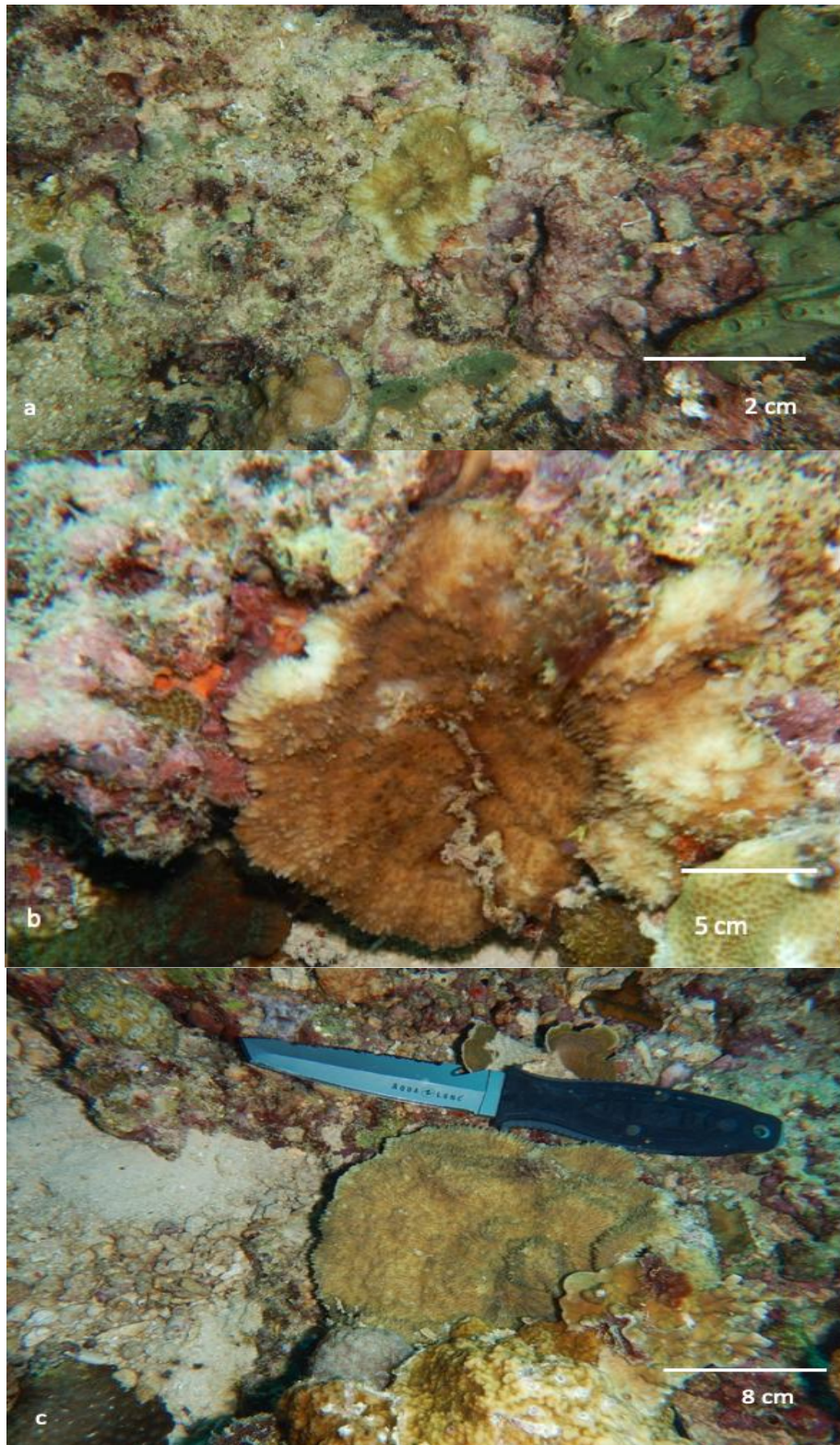
Fig. 2. Podabacia kunzmanni at different depths: a) small (in 4 m), b) large (in 10 m) and c) very large (in 18 m), all attached to coral rock